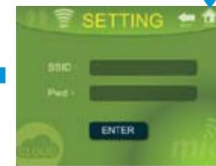
Step 2) Register meter to AP (Fill out SSID.PW of AP)