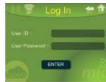
Step 3) Log in with ID.PW (Forget password)