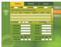
Set up meter info (For alarm .etc)