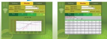
Display and view curve or data by clicking icons after selecting on line WiFi meters or selecting time periods up to 2 months