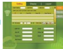
Set up user info (For mail alert)