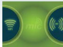
Welcome to wireless world :RF & WiFi