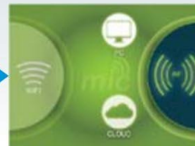
Choose WiFi ,click Cloud